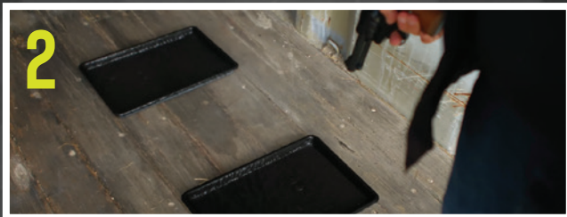
THREE .22 CALIBER ROUNDS FIRED AT PAN.