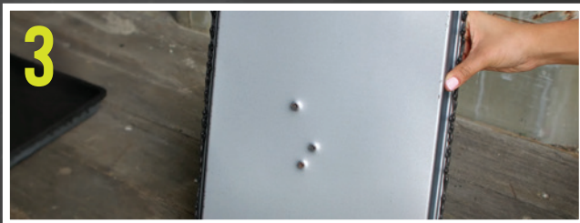
BULLETS PENETRATED THE PAN.