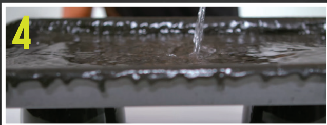
EXPANDOTHANE DID NOT LEAK!