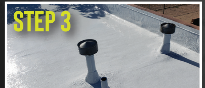
APPLY UV PROTECTIVE COATING